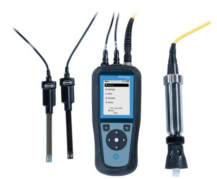
HQ Series Multi Parameter Portable Meter